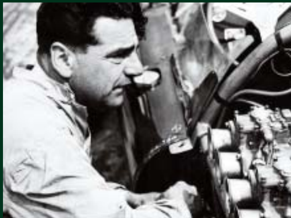
▲ John Cooper – legendary F1 constructor and Mini Cooper originator.

The Cooper Car Company became the world's first and largest post-war, specialist racing car manufacturer culminating in winning the Formula 1 Drivers' and Constructors' World Championships in 1959 and 1960 with Jack Brabham at the wheel. Soon after, Coopers went to Indianapolis